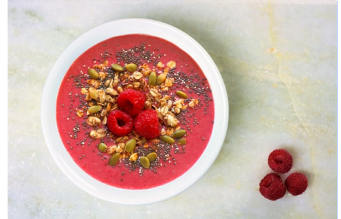
Photo and Recipe @ https://legionathletics.com/superfood-smoothie-recipes/