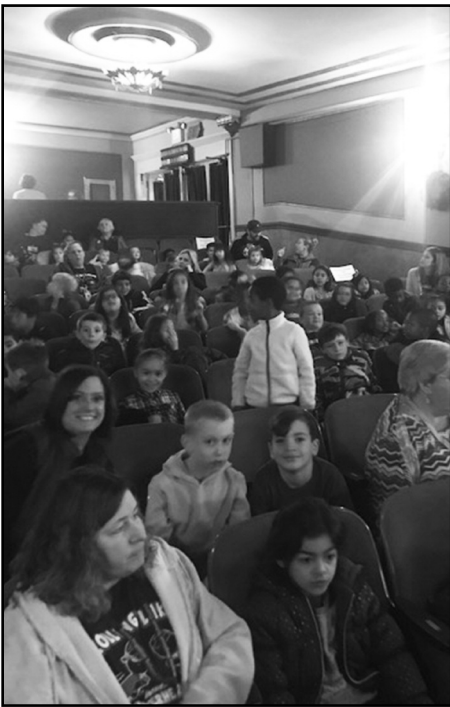
On December 14, Collings Lakes Elementary School took a trip to the Pitman Theatre to see "Santa's Frozen Adventure."